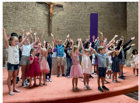
Thank you Kindy and Year 6 for a beautiful family mass last Sunday.

Click on this link for the Kuringai Chase Parish Bulletins