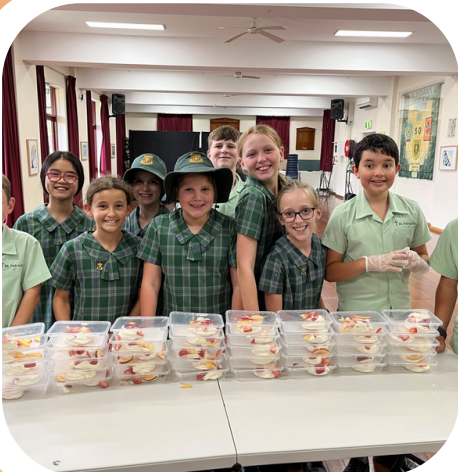
Mercy Action Group preparing dessert for The Dish this week

Thursday 6th April: The Resurrection Stage 2