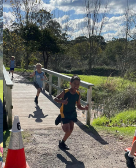
Diocesan Cross Country Team 2022